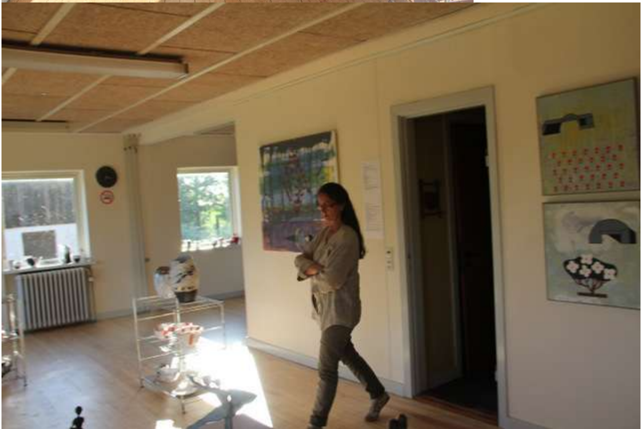
From Askoe, Denmark