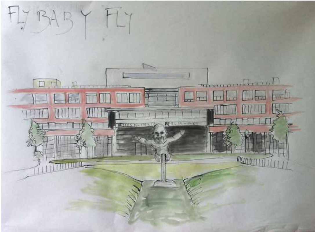
Fly, Baby, Fly Sketch