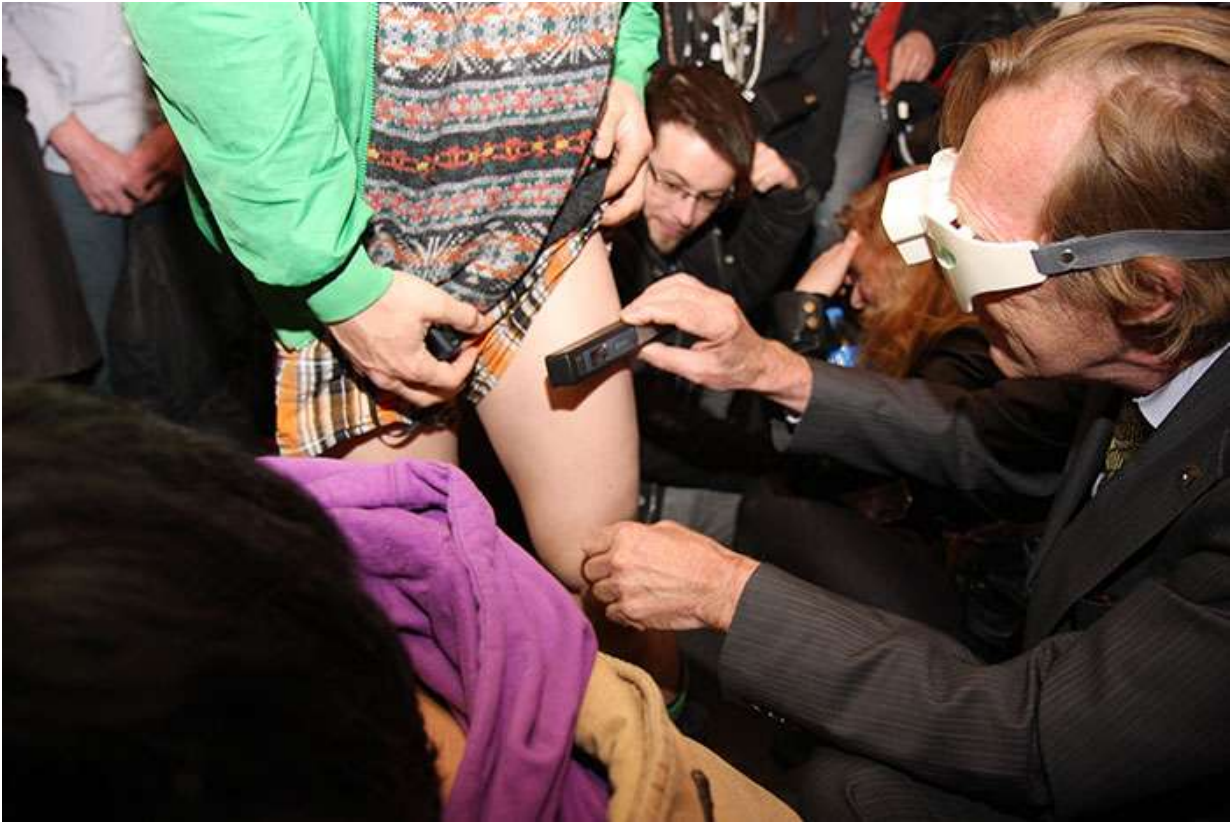
From „Escape“ International performance festival, Berlin