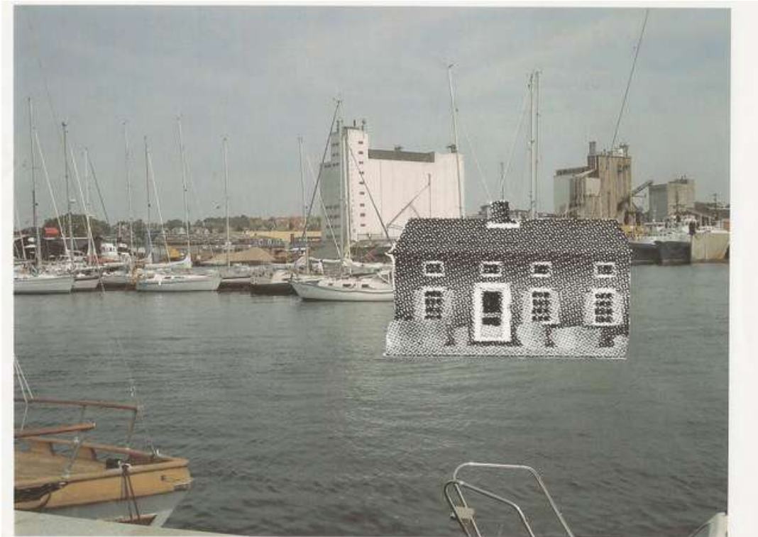
Crying House - Sketch